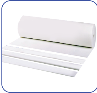
Ceiling fine filter